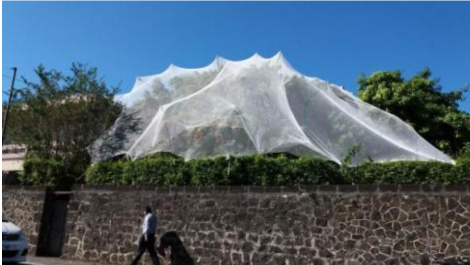
Partially netted tree: A white net has been used and lifted off the tree canopy with poles. The net has not been sealed.