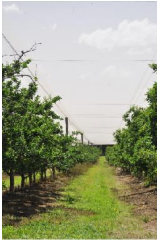
Fixed frame netting in Australia for apples