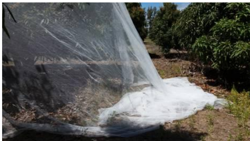
The net excludes birds because it is resting on the ground.