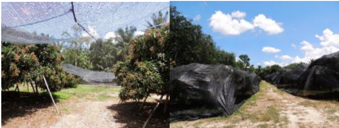
Fixed frame netting in Thailand for longan

(See: http://www.wildlifefriendlyfencing.com/WFF/Netting.html )